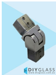
25x21mm Adj, Vertical Joiner for Glass Top Rail