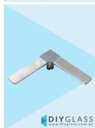
25x21mm 90 Degree Joiner for Glass Top Rail