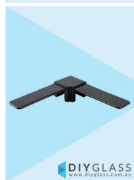
25x21mm 90 Degree Joiner for Glass Top Rail