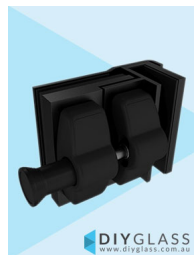
Black Glass Gate Latch for External Glass to Glass