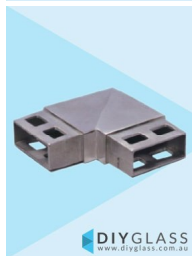
50x25mm 90 Degree Joiner for Glass Offset Rail