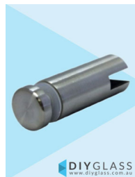
50x10mm Rail Connector for Glass Offset Rail