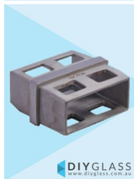
50x25mm In-Line Joiner for Glass Offset Rail