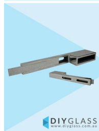
50x10mm Extended Wall Plate for Glass Offset Rail