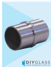
38mm In-Line Joiner for Glass Offset Rail