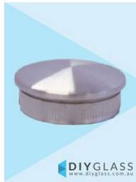
38mm Domed End Cap for Glass Offset Rail