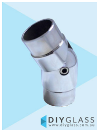
38mm Adjustable Joiner for Glass Offset Rail