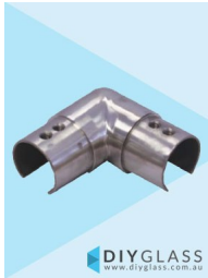
38mm 90 Degree Radius Joiner for Glass Top Rail