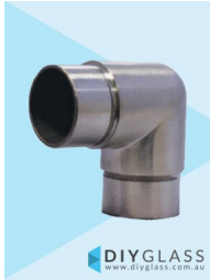
38mm 90 Degree Radius Joiner for Glass Offset Rail