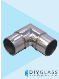
38mm 90 Degree Joiner for Glass Offset Rail