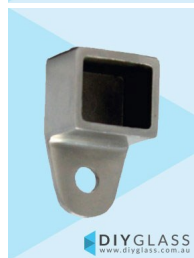
25x21mm Wall Plate for Glass Balustrade Top Rail