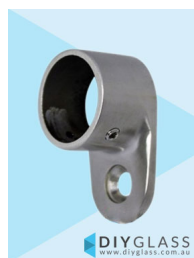
25.4mm Wall Plate for Glass Top Rail