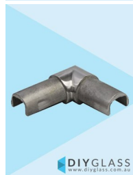
25.4mm 90 Degree Joiner for Glass Top Rail